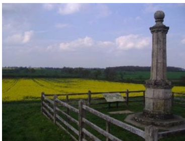
Naseby Battlefield Memorial